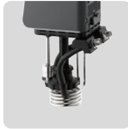
Easy to install pump set (accessory)