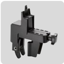
Stable and robust universal bath attachment clamp