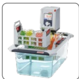
Ingenious drip off design (BT and B tanks)